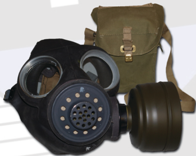
A Second World War gas mask. Imagine trying to eat your bridle through that!

Though the Forth Rail Bridge was not targeted during this raid, many passengers on a train crossing at the time thought they were the target.