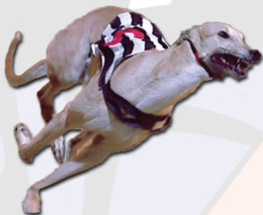
Right colours, wrong sport...

This was perhaps not surprising as the West Fife area was badly hit by the strikes in the coal mining industry as the miners fought to avoid wage cuts, the lack of demand for linen, and the closure of Rosyth Dockyard between 1925 and 1938.