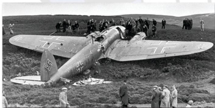
Crowds gather round one of the downed Heinkels

Anti-air-raid gunners on the Forth were engaged in a gun-drill at the time, and quickly had to exchange their dummy ammunition for live as the German planes appeared overhead.