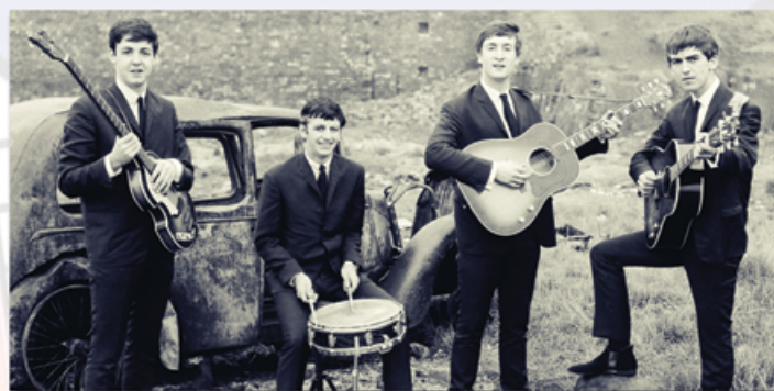
The Beatles, Paul, Ringo, John and George.

1962 was also the year in which The Beatles became the most popular band in Britain and Europe, and ever since then current hits have been played before and after games, along with appeals to move cars and pick up lost children.