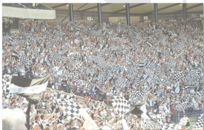
Thousands and thousands of Pars fans together at Hampden for the 2004 Scottish Cup Final.

People saved the club from extinction because it is very important to the community of Dunfermline and it has been for many generations of West Fife folk.