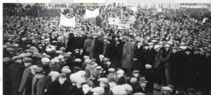
A march protesting against high unemployment

However unemployment fell a lot in 1933, 1934 and 1935. By January 1936 it stood at 13.9%. This fall continued, and by 1938 the level of unemployment was down to 10%.