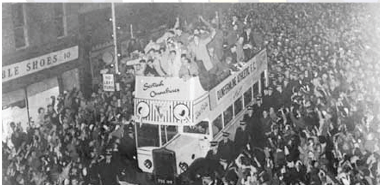
Bringing the Cup home to Dunfermline, as thousands of fans surround the team bus.

Want to know more? http://bit.ly/historypars6