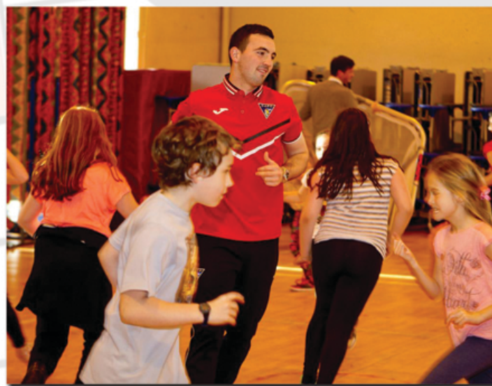
The Pars have great links with local schools.

Lots of people, including several Supporters' Clubs, put in new money to a new Community Interest Company (which is a bit similar to a charity) and no one person owns more than 10% of the shares.