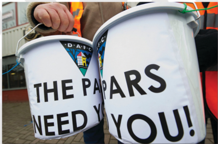
When the club needed it, the fans were there to help.

Most football clubs in Britain are owned by one person. However this is changing, with an ever-increasing number owned either wholly or partly by Supporters' Trusts.