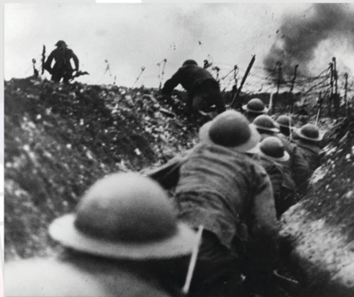
Men waiting in line to go 'over the top' during the Battle of the Somme.

Unfortunately this unit was right in the battle front when the British Army attacked on 1 July 1916 on the Somme. Many Dunfermline men died, as part of the 20,000 killed that day.