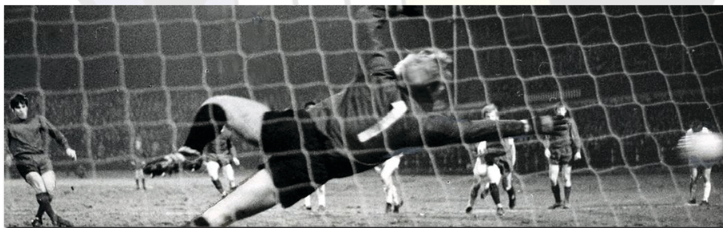
Beating Anderlecht 3-2 in 1970. Sadly the Pars missed a penalty (above) and lost on away goals.

During these times Dunfermline Athletic was also playing football regularly in Europe. Between 1961 and 1970 the twenty home games played at East End Park saw 17 wins, 2 draws and only one defeat. At one point the Pars won 12 home European matches in a row at East End, a Scottish record!