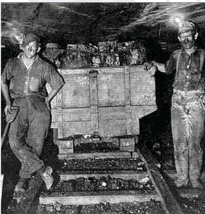
Tough conditions working down the mines.

"What say we play football instead, eh chaps?"